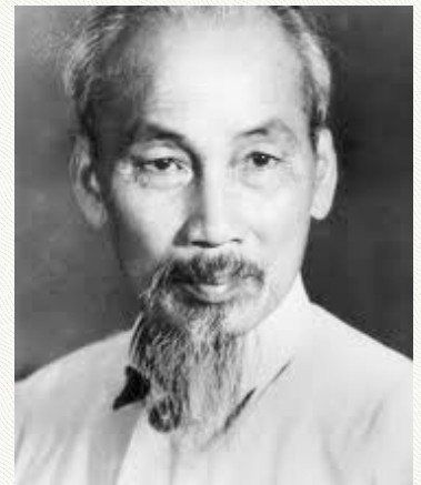
Ho Chi Minh led a Communist government in the North.